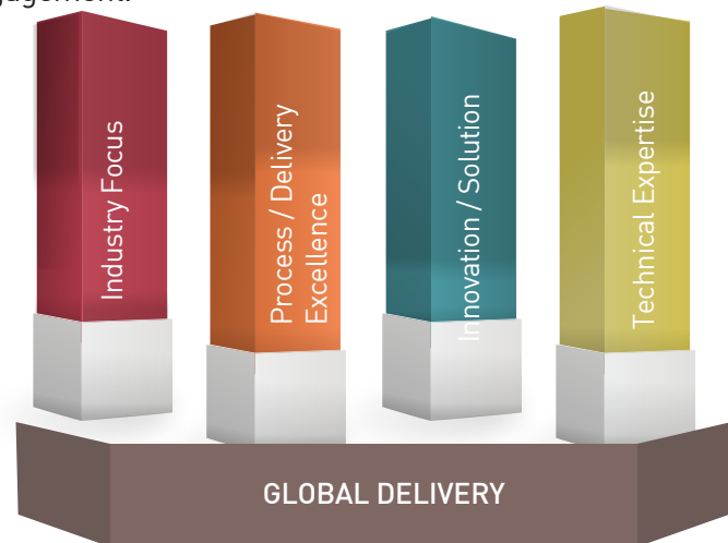
CoE - 4 KEYS PILLAR